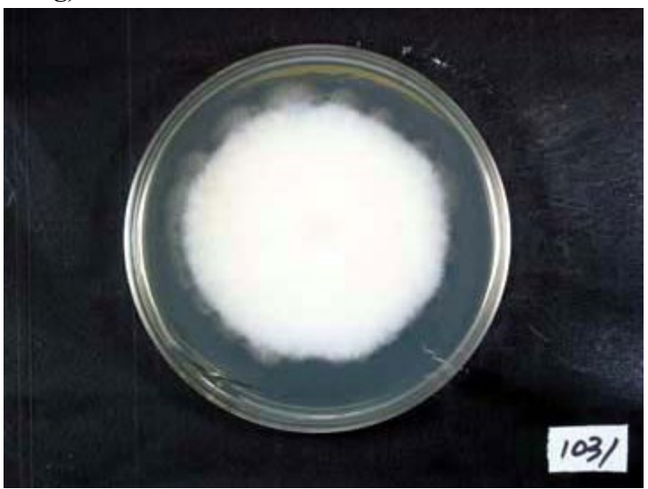
Colony on CD plate