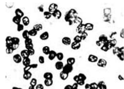
Photographs of conidiophore