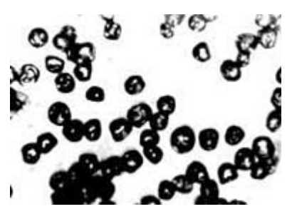
Photographs of conidiophore