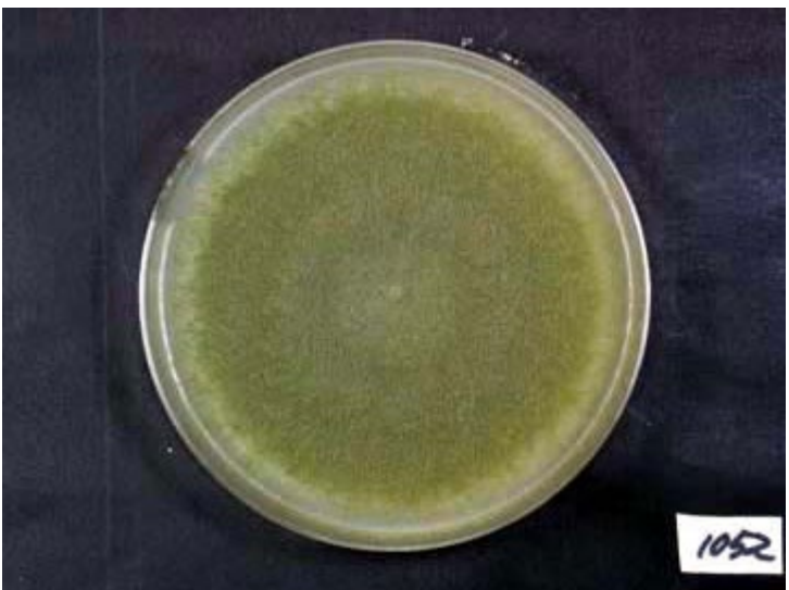
Colony on CD plate