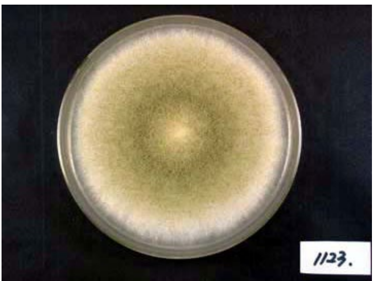
Colony on CD plate