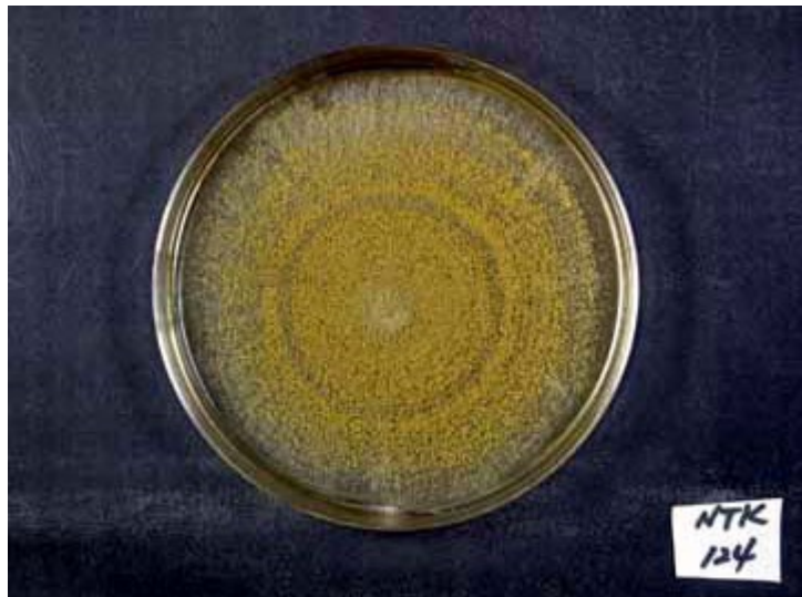
Colony on CD plate