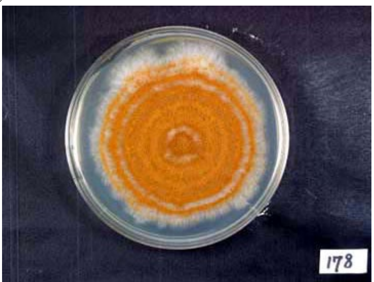
Colony on CD plate