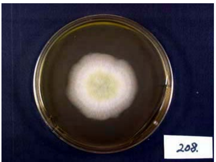
Colony on CD plate