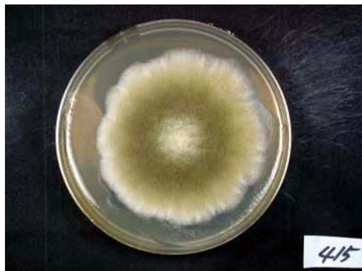
Colony on CD plate