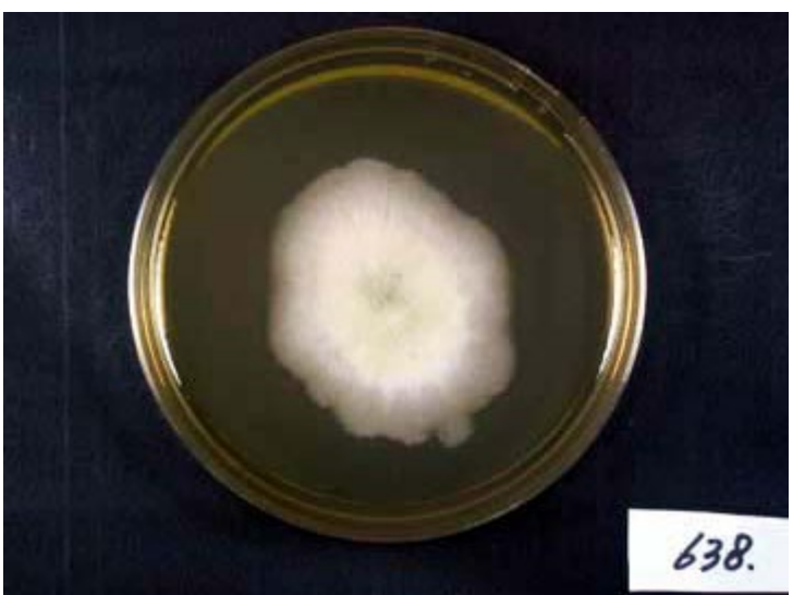
Colony on CD plate