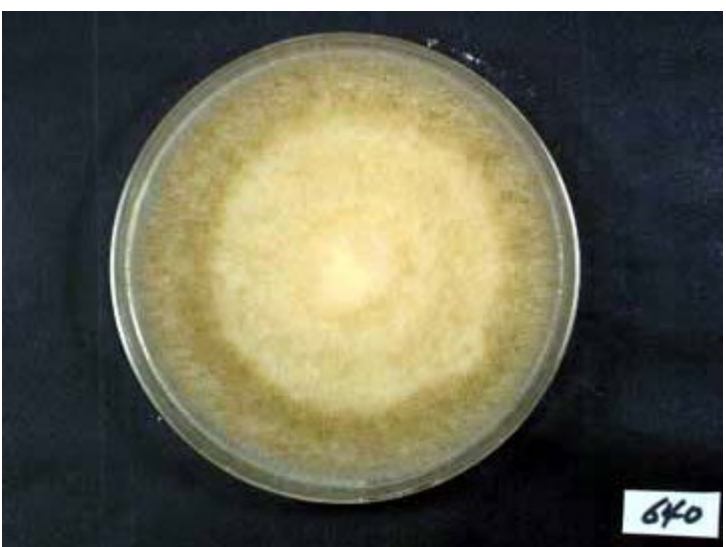
Colony on CD plate