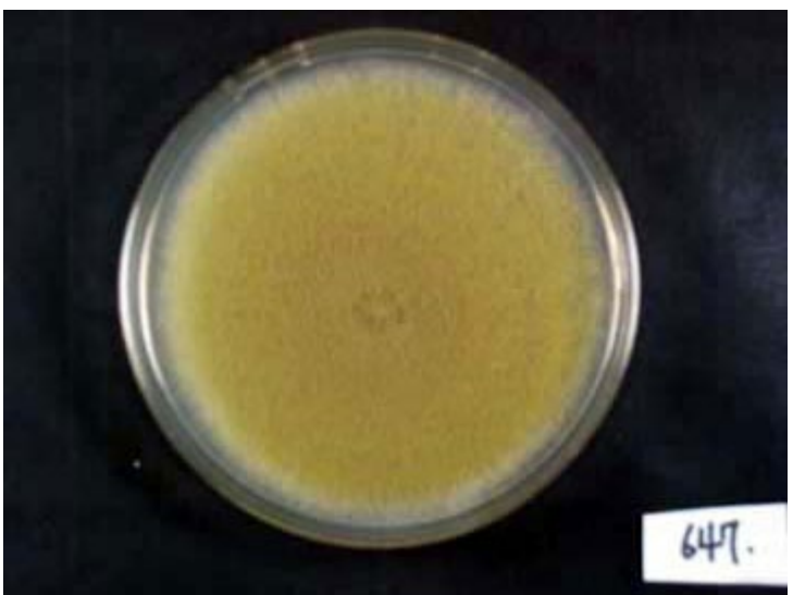
Colony on CD plate