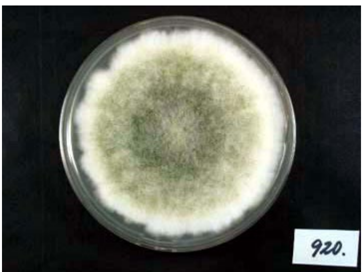
Colony on CD plate