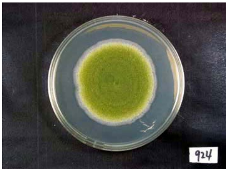
Colony on CD plate