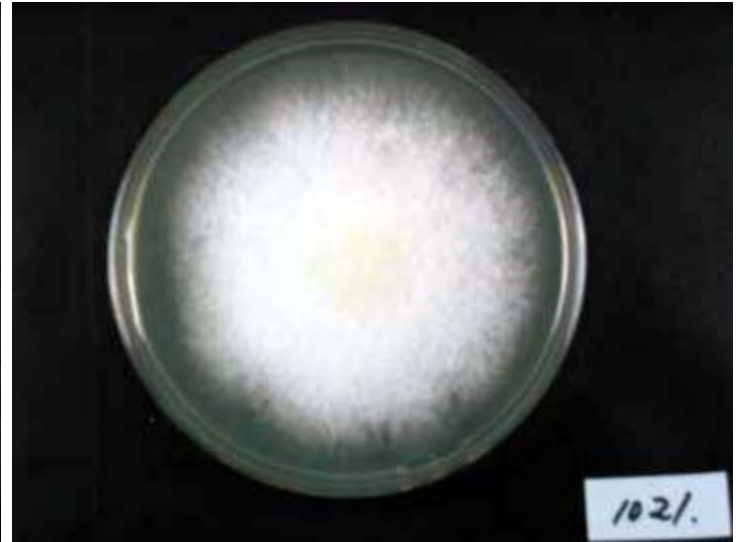
Colony on koji extract plate