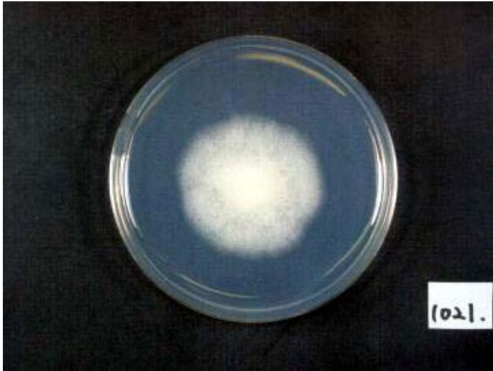
Colony on CD plate