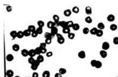
Photographs of conidiophore