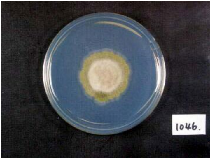
Colony on CD plate