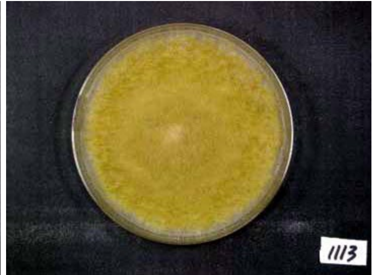
Colony on koji extract plate