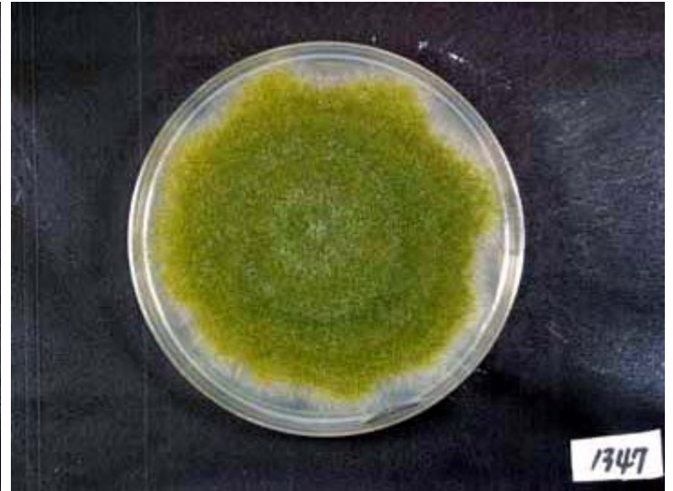
Colony on koji extract plate