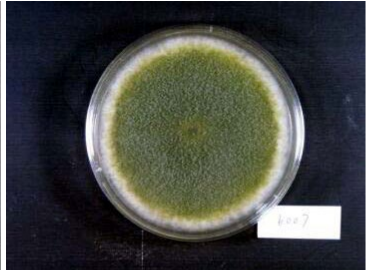
Colony on koji extract plate