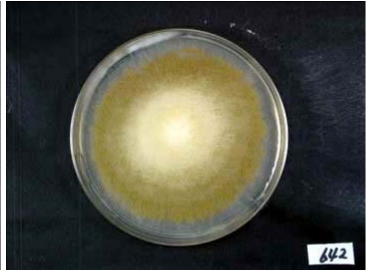
Colony on koji extract plate