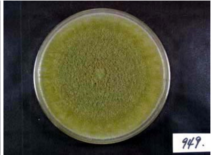
Colony on koji extract plate